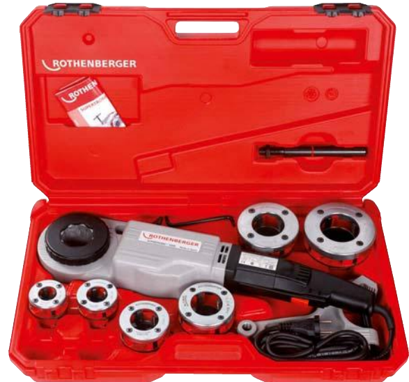
Fig. Similar, SUPERTRONIC® 2000 Set