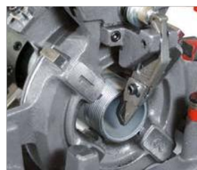
Fig. Transport Frame for 3 and 4 SE (No. 57050)

Automatic die heads with quick adjustment of thread size automatic thread length, finely adjustable thread depth without recentering