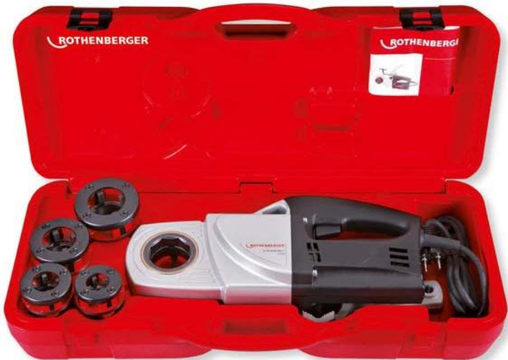
Fig. SUPERTRONIC® 1250 Set (No. 71450)