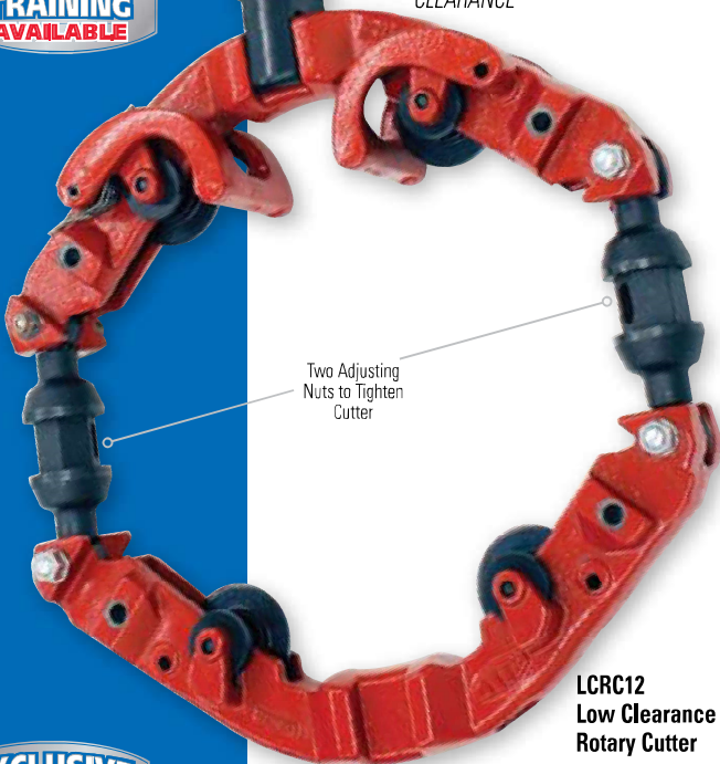
LCRC12 Low Clearance Rotary Cutter

For heavy wall steel and stainless steel, order RCX cutter wheels (03550) and eight RC8-30XR rollers (93222).